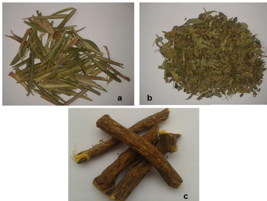
Figure 1: Olive leaves (a), basil leaves (b) and licorice roots (c)